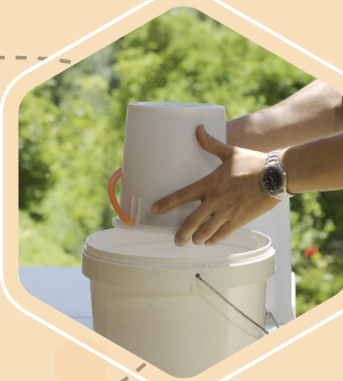
step 4 Shake out the sugar.