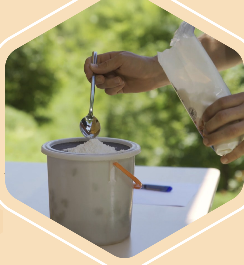
step 3 Add powdered sugar.