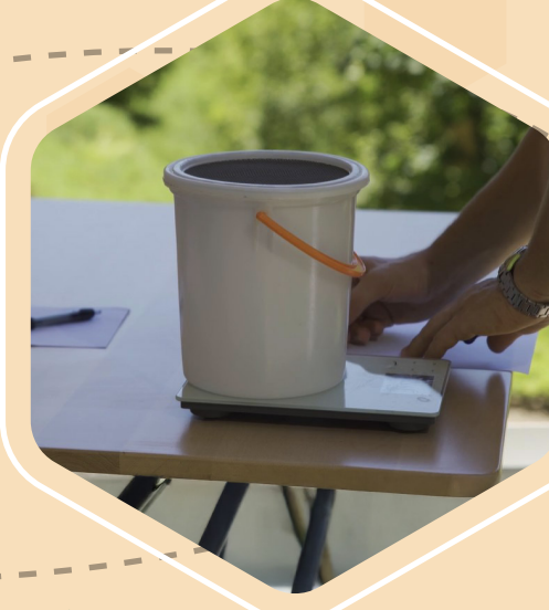
step 6 Weigh the bees to estimate their numbers more accurately.