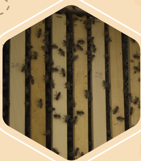
step 1 Select a frame to collect bees.