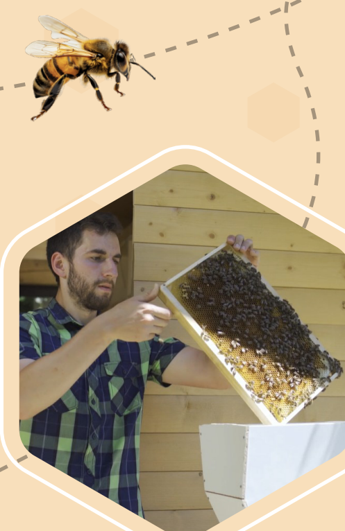
step 2 Collect approximately 300 bees.