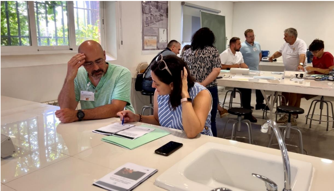
Figure 3 The training for international advisors held in Madrid, organized by UCM and SLU (International B-THENET Centre for advisors), held the 13th and 14th of June 2024.