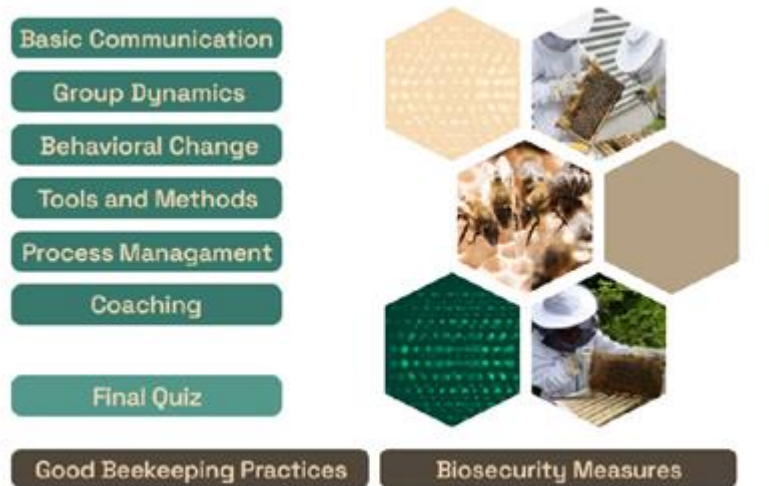
Figure 2 OER training modules at the platform Canvas, SLU